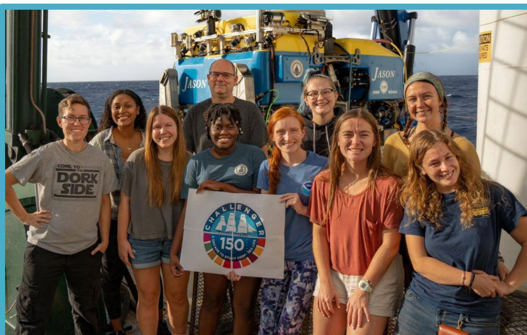
A recent C150-affiliated research cruise to the Northeast Pacific deep ocean (May 2023)

The Challenger 150 UN Decade of Ocean Science programme was developed by the DOSI Decade of Deep-Ocean Science WG, and now represents the WG's main activities. The Challenger 150 programme focuses on global cooperation in deep-ocean science. It is recognised as a high-profile programme of the UN Ocean Decade. Since its launch, two 'Challenger 150 Highlights' documents have been produced (Year 1 and Year 2). The programme has so far completed a total of 27 affiliated research cruises in five ocean basins, with many more expeditions in the pipeline.