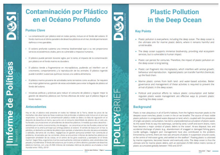
DOSI policy brief on plastic pollution in the deep ocean in Spanish and English