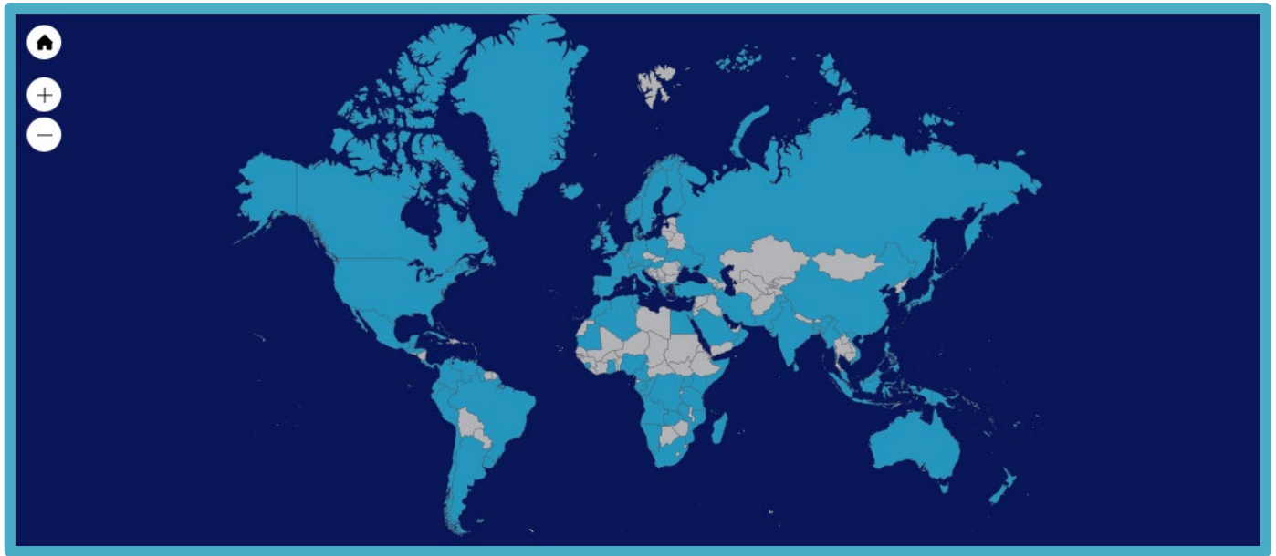
Current DOSI network subscriber coverage – countries represented in light blue (at least 112)