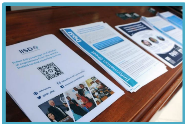
Dedicated DOSI publications for ISA meetings