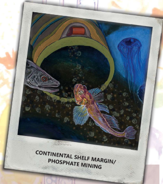
CONTINENTAL SHELF MARGIN/ PHOSPHATE MINING

I was interested to show the balance and interdependence of species, one of my criteria in choosing which species to show among the many possible for each ecosystem. An example of this interdependence is the three species shown in CONTINENTAL SHELF MARGIN/PHOSPHATE MINING: hake ( Merluccius merluccius , a member of the cod family), bearded goby ( Sufflogobius labrobarbatus ) and African jellyfish ( Chrysaora africana ). If the goby is killed by the vacuum, the hake population is reduced because of the loss of its food source. The jellyfish then proliferates, destabilising the natural balance of the ecosystem. It also causes the loss of a food source for humans.