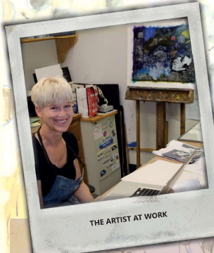
THE ARTIST AT WORK

2 Deep-Ocean Stewardship Initiative, University of Southampton, Southampton, UK